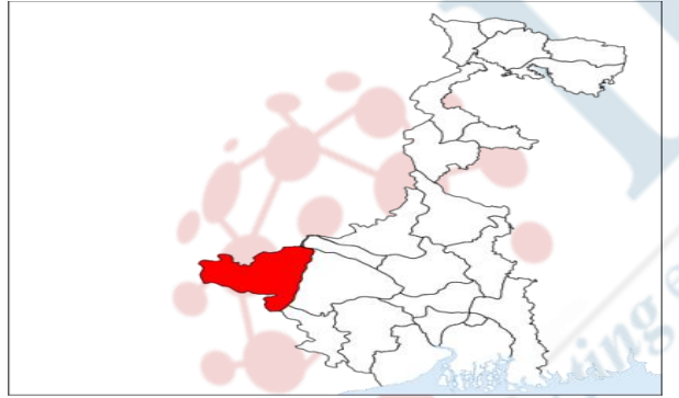
Diagram 1: Purulia District in the Map of West Bengal